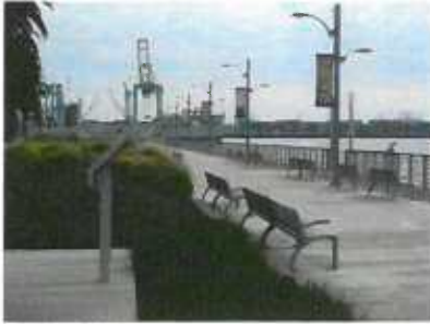
Berth 94 Promenade Boardwalk, benches overlooking Main Channel and Ports America Cruise Terminal, Berth 93