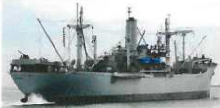
The Lane Victory Berth 49, 3600 Miner Street (Leased Property)