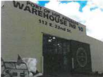
Crafted at the Port of Los Angeles 112 E. 22 nd Street (Leased property)