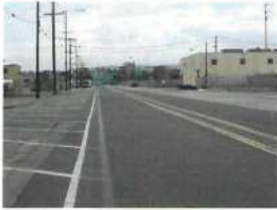
Cannery Street Between Barracuda St. and S. Seaside Ave.