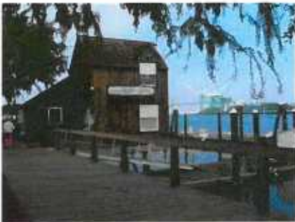
Ports O' Call Village Berths 75 – 79, 1190 Nagoya Way