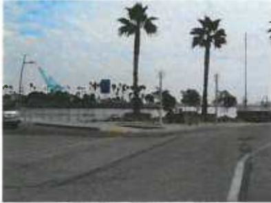
Berth 69, Public Outlook Point Located on Admiral Higbee Way at Southern end of Signal Street