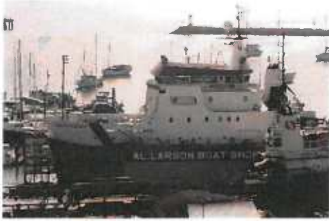
Al Larson Boat Shop & Marina 1046 S. Seaside Avenue (Leased property)