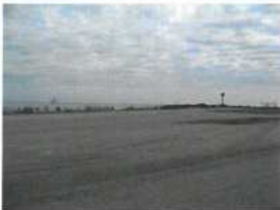
Harbor Department paved lot Pier 400, end of Navy Way Ocean views/open horizon look