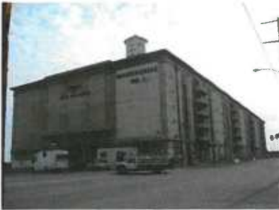
Warehouse No. 1 (first floor only) 2500 Signal Street Railroad tracks, subway look