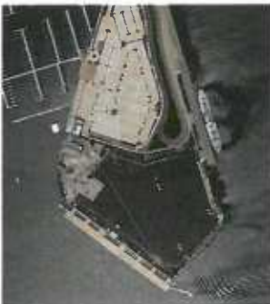
Berth 46 Wharf area and backland area Located at southern end of Miner Street