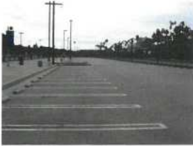
Ports O' Call Overflow Lot

Please note that the below parking lot are also use for Port events, construction projects, and/or other Port discretionary projects and may not be available. Please call the Wharfing Division to check availability on parking lots and Port controlled facilities.