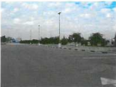
22 nd Street and Sampson Way

Located on 22 nd Street between Miner St. and Sampson Way