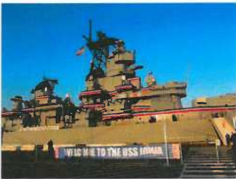
USS Iowa 250 S. Harbor Blvd. (Leased property)