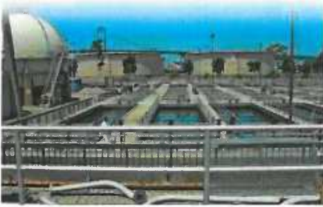
Terminal Island Water Treatment Plant 445 Ferry Street Operated by Department of Public Works (Leased property)