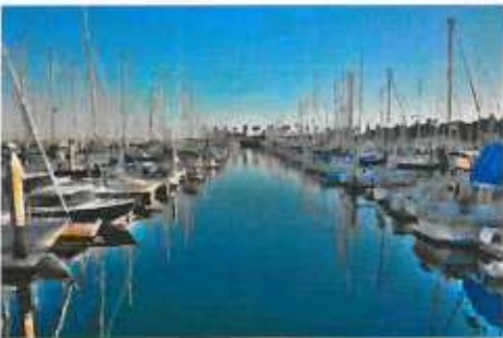
California Yacht Marina - Cabrillo Marina Berths 29-33, 224 Whaler's Walk (Leased property)