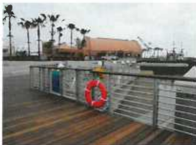
Berth 85, Recreational Courtesy Dock Wood boardwalk, picnic benches and recreational boat docks