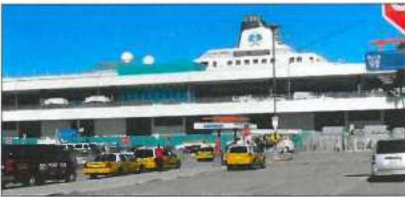
Ports America Cruise Terminal Berths 91-93, 100 Swinford Street (Operating agreement)