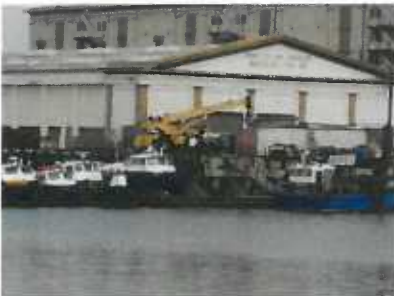
U. S. Water Taxi Berth 60, end of Signal Street (Leased Property)