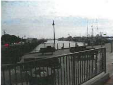
Berth 73, SP Slip Fish boats, docks, public area with benches Located on Sampson Way & Timms Way