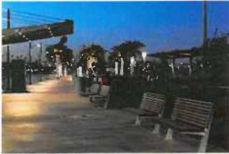
Cabrillo Way Marina Berths 42-43, 2293 Miner Street (Leased property)