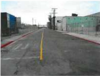
Sardine Street Between Barracuda St. and Ways St.