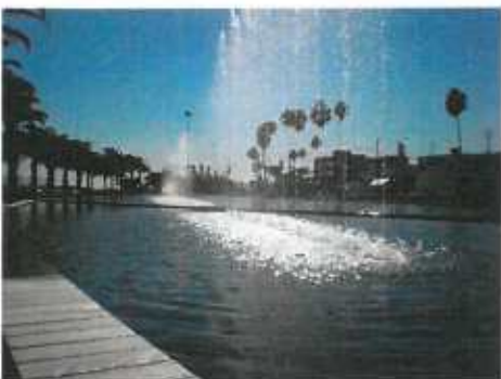
Gateway Plaza Fanfare Fountain Harbor Blvd. at Swinford Street